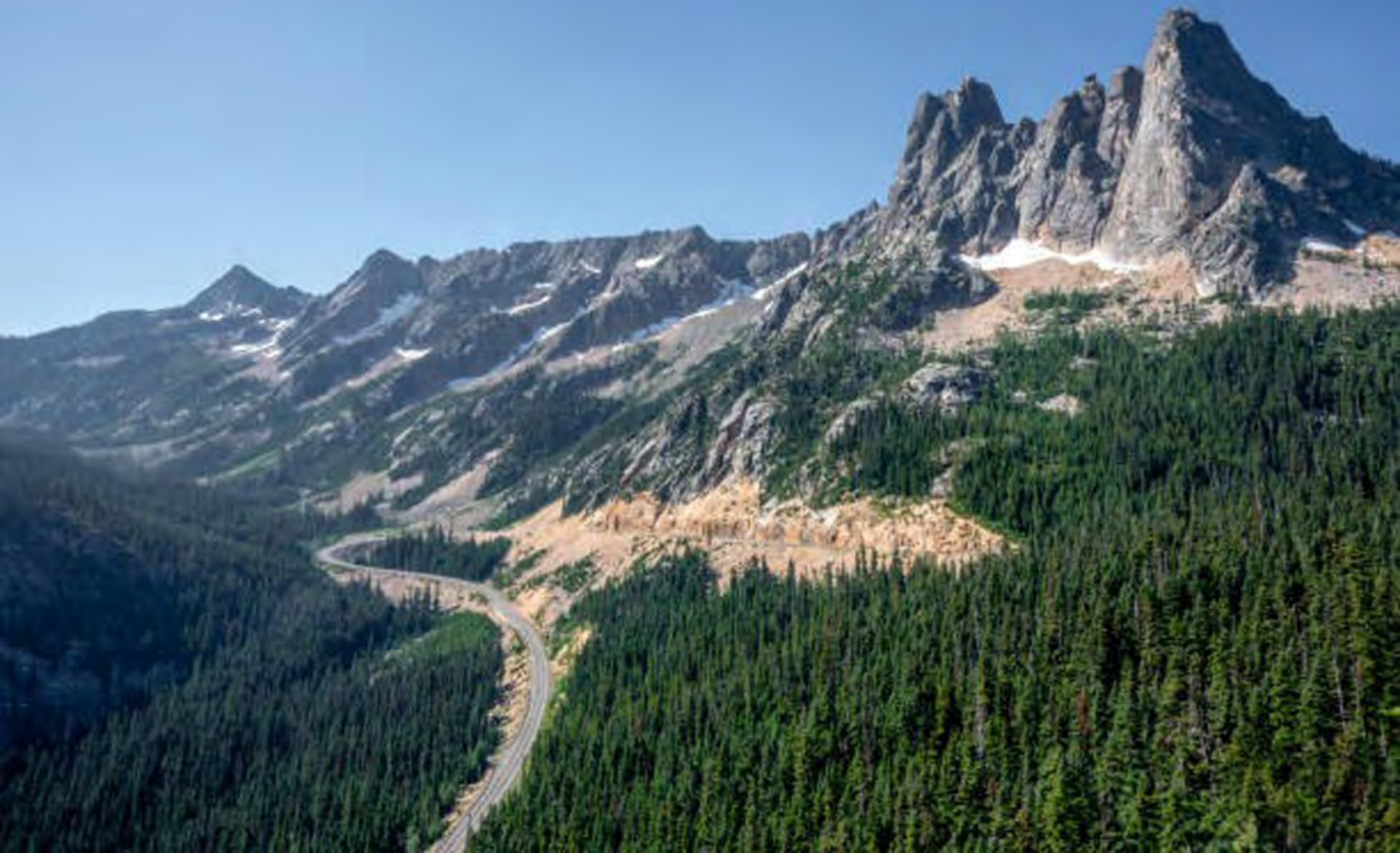
East side of Washington Pass / Rainy Pass